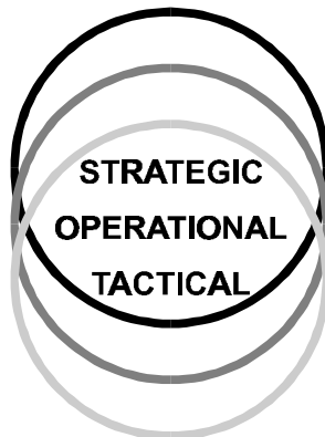
Figure 2. The Levels of War Compressed.

The distinctions between levels of war are rarely clearly delineated in practice. They are to some extent only a matter of scope and scale. Usually there is some amount of overlap as a single commander may have responsibilities at more than one level. As shown in figure 1, the overlap may be slight. This will likely be the case in large-scale, conventional conflicts involving large military formations and multiple theaters. In such cases, there are fairly distinct strategic, operational, and tactical domains, and most commanders will find their activities focused at one level or another. However, in other cases, the levels of war may compress so that there is significant overlap, as shown in figure 2. Especially in either a nuclear war or a military operation other than war, a single commander may operate at two or even three levels simultaneously. In a nuclear war, strategic decisions about the direction of the war and tactical decisions about the employment